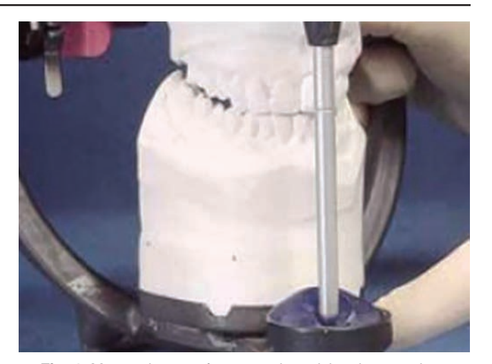
Fig. 4: Mounted casts of cemented provisional restorations