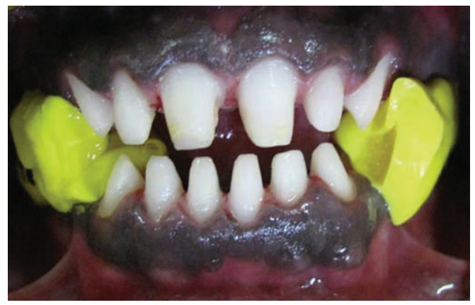
Fig. 1: Evaluation of anterior teeth preparation with the help of posterior index