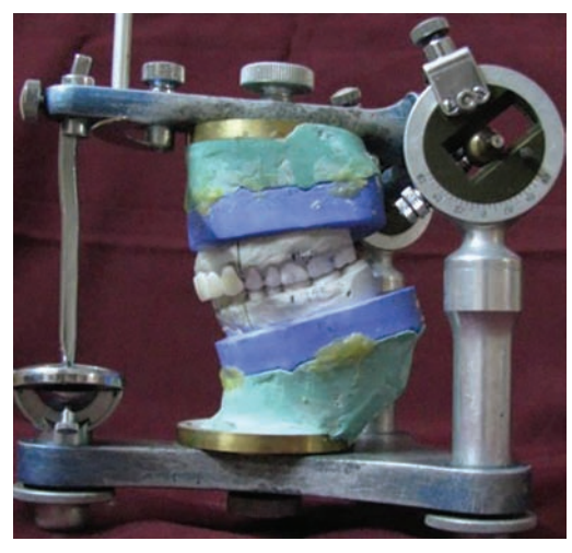
Fig. 2: Diagnostic wax-up